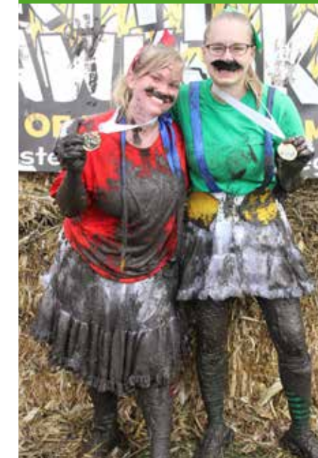
In October, nearly 200 racers braved the mud and obstacles to raise money for student activities at the second annual Dirty Hawk 5K in West Burlington.

The SCC Foundation hosted its annual Scholarship Reception in the Loren Walker Arena in November. A record 451 attendees spent the afternoon meeting each other and sharing their SCC experiences.